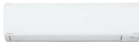
FTX18/24 Indoor Unit