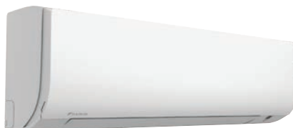
FTX09/12/15 Indoor Unit

Pushing the POWERFUL button on the remote control gives you a boost in cooling or heating power for a 20-minute period, even if the unit is already operating at high capacity.